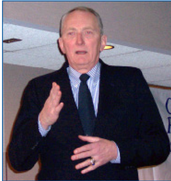
Gen. (ret.) Erwin Rokke speaks on pending intelligence issues for the United States

Rokke discussed some changes prompted by the 9-11 Commission to streamline intelligence collection, analysis and distribu-